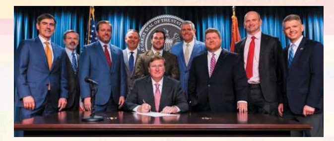
We were at the forefront of efforts to cut state income tax.