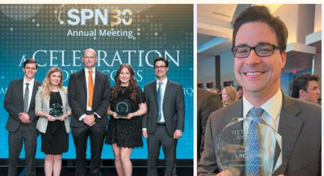
We won two prestigious national awards.

December: Publish Budget for State With a massive state budget surplus of over $1 billion, we published a budget that we believe conservatives should support.