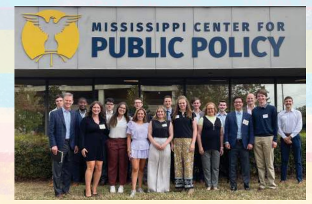
We enrolled students into the inaugural class of the Mississippi Leadership Academy.