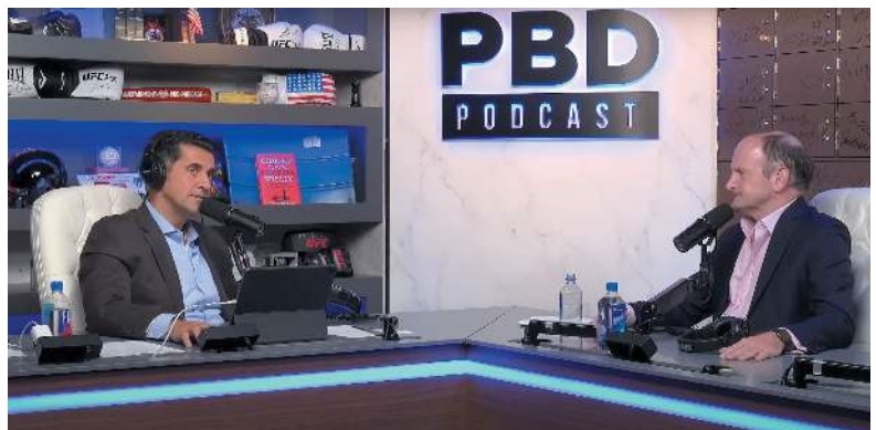
Podcast with Patrick Bet-David

We don't just produce our own podcast. MCPP's CEO, Douglas Carswell, has appeared on others, including Patrick Bet-David's podcast, watched by over 197,000 across America.