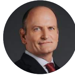
DOUGLAS CARSWELL President & CEO